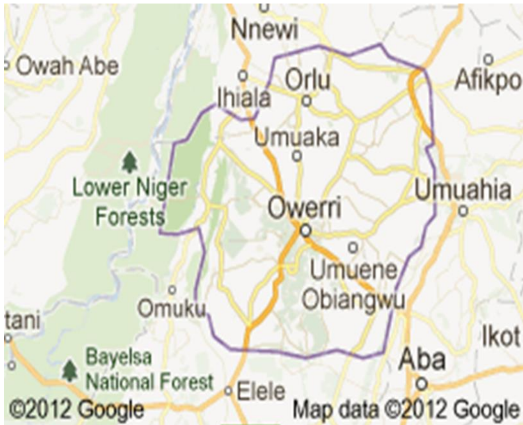
Figure 2: Map of Imo State Showing Owerri Municipality ( www.imostategovernment.blogspot.com )