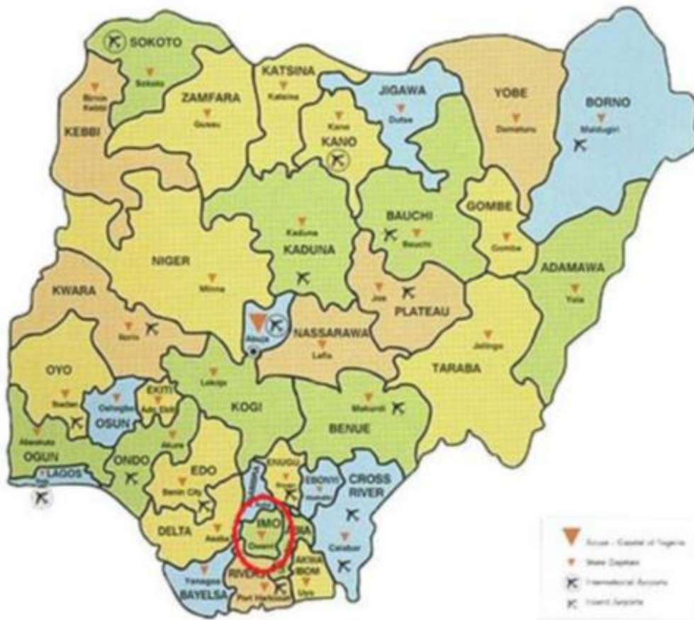
Figure 1: Map of Nigeria Showing Imo State ( www.en.wikipedia.org/wiki/Imo_State )

This perhaps facilitates the teaching and learning of basic science and technology and also presents the opportunity of synchronizing school culture and learners' cultures.