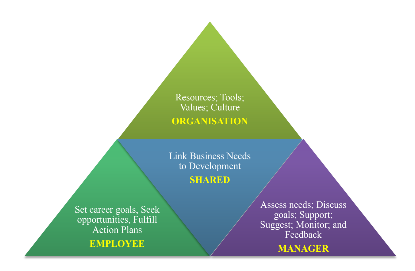
Figure 3: Kayes Model of Accountability

organisation each have specific accountabilities to make development successful.