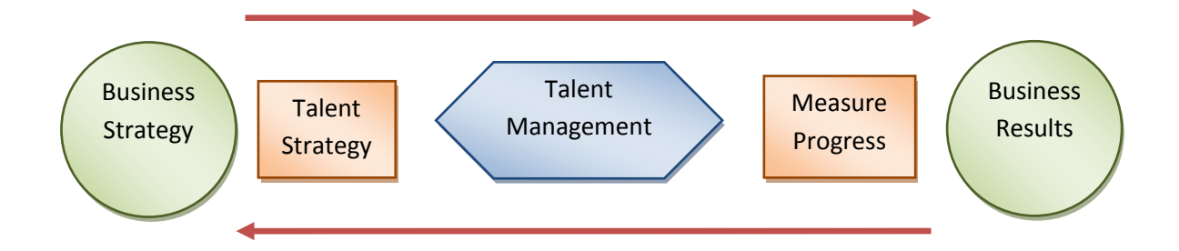
Figure 1: Talent management framework of Silzer and Dowell (2010, p.21)

Silzer and Dowell (2010: p. 21) suggest the following model as a talent management framework.