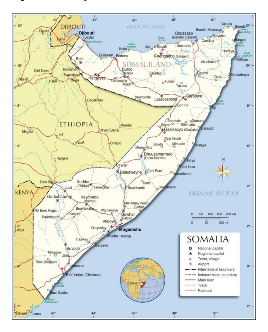
Figure 1: The Map of Somalia<sup>8</sup>