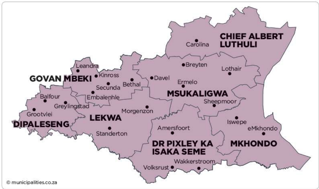
Figure 1.1: Map of Gert Sibande District