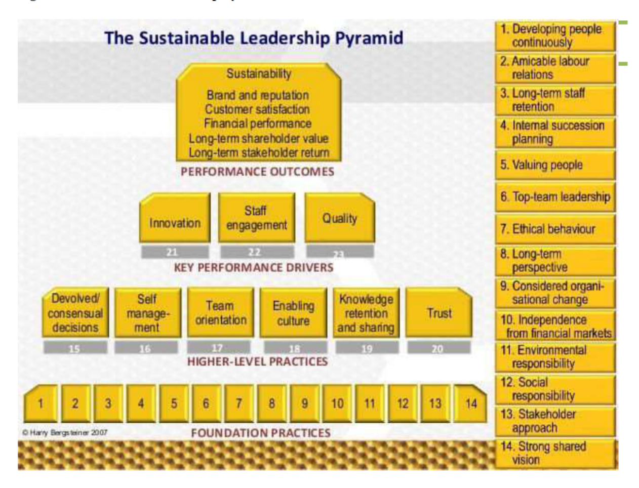
Figure 2.1: Sustainable Leadership Pyramid