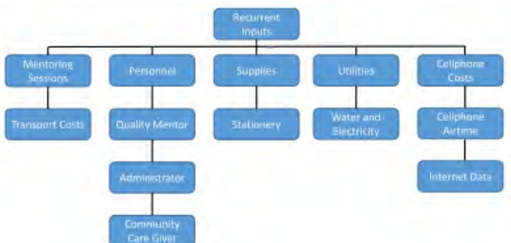
Figure 2 - Recurrent Costs

Recurrent inputs in the Nompilo Project RCT have been identified as personnel, supplies, buildings operations and maintenance and the fortnightly mentoring sessions. The costs associated with these are inputs referred to as either recurrent or operating costs. Figure 2 highlights the recurrent resource inputs that were consumed by the Nompilo Project RCT.