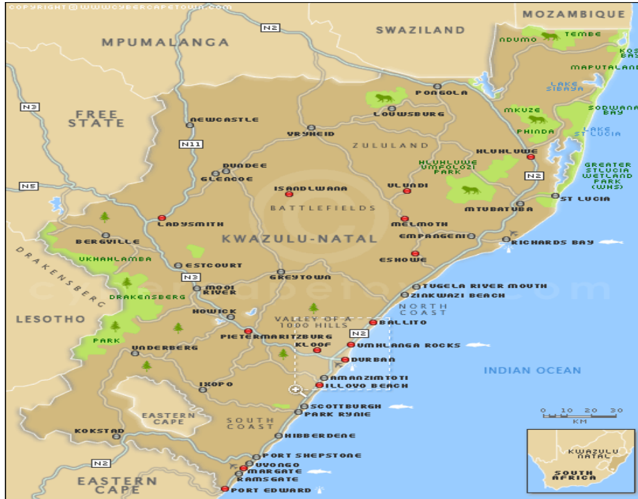
Figure 1.1 Map of KwaDumisa, KZN