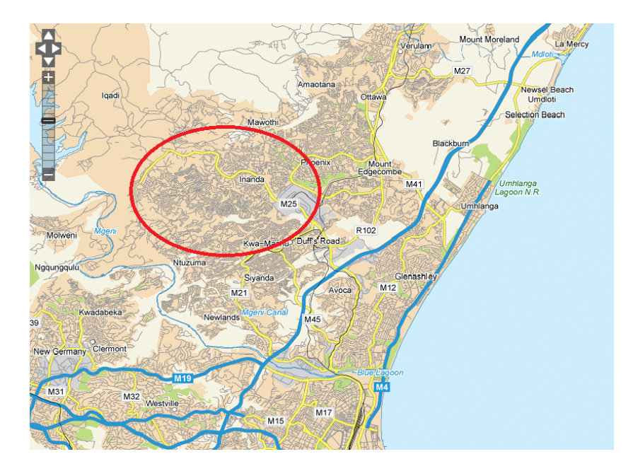
Figure 4.1: Map showing the proximity of Inanda in relation to Durban.