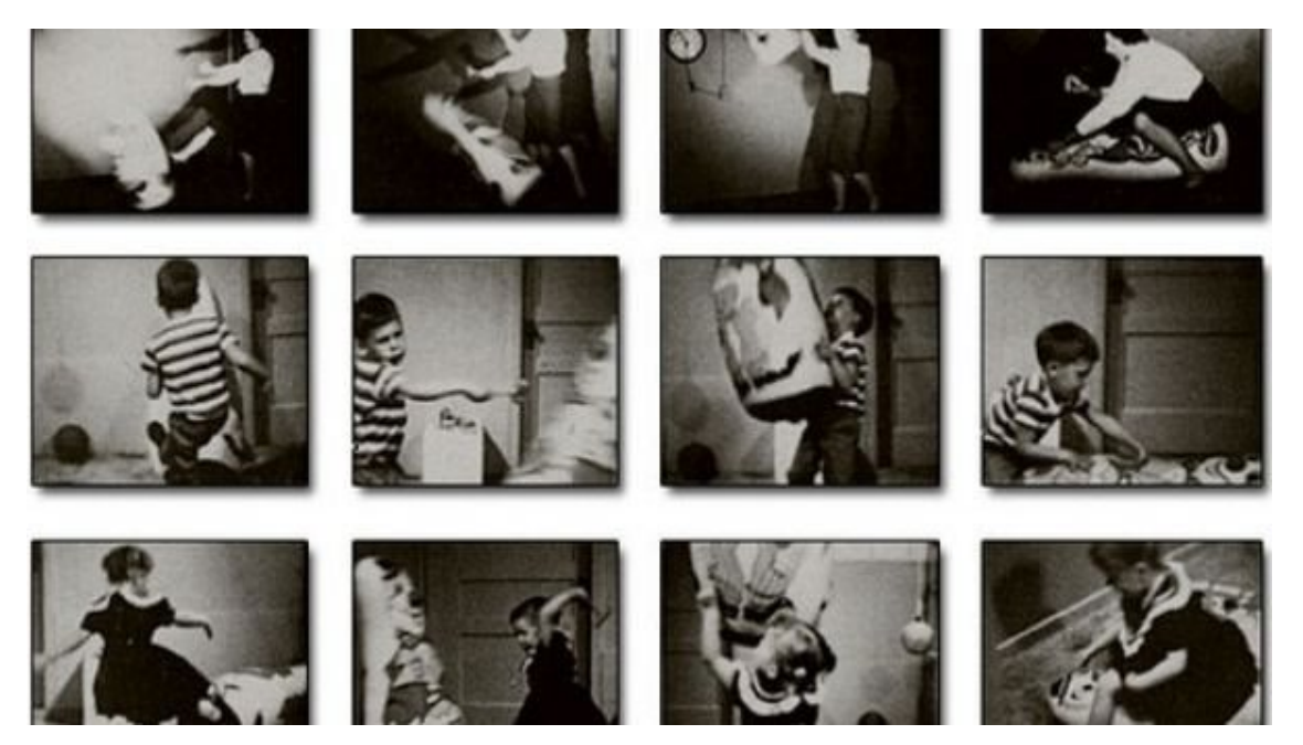
Figure 3.1 Photographs of children imitating the violent behaviour of the female model they had observed in the film (Bandura, Ross & Ross, 1963).

One of the early analyses of observational learning of aggression Bandura (1962) and Bandura, Ross, and Ross (1963) examined the relative potency of aggressive models presented in different forms.