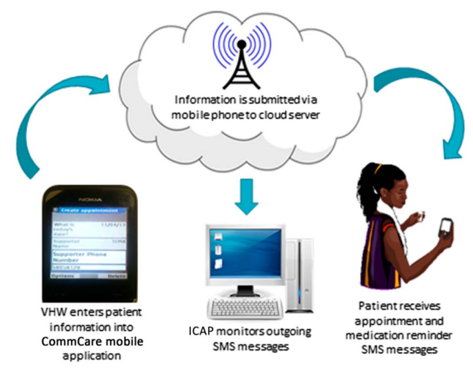
FIGURE 1. Architecture of the SMS system.

mHealth use and acceptability were assessed using mixed methods. mHealth use was quantitatively analyzed from study process data, drawn from a monthly Program Characteristics Survey to track CIP implementation, and an intervention receipt log for SMS messages and mobile airtime to document the "dosage" of mHealth that was received by study patients and treatment supporters at the CIP sites. mHealth acceptability was assessed using questions about intervention acceptability that were integrated into monthly follow-up interviews and qualitatively evaluated via in-depth interviews with a purposive, heterogeneous subset of patients and health care providers, 6–12 months post study initiation, at the CIP sites. The use and acceptability of mHealth tools were contextualized by adherence data, drawn from monthly follow-up interviews with 371 patients (measurement cohort) at CIP and SOC sites during the course of TB treatment (6–9 months). 15