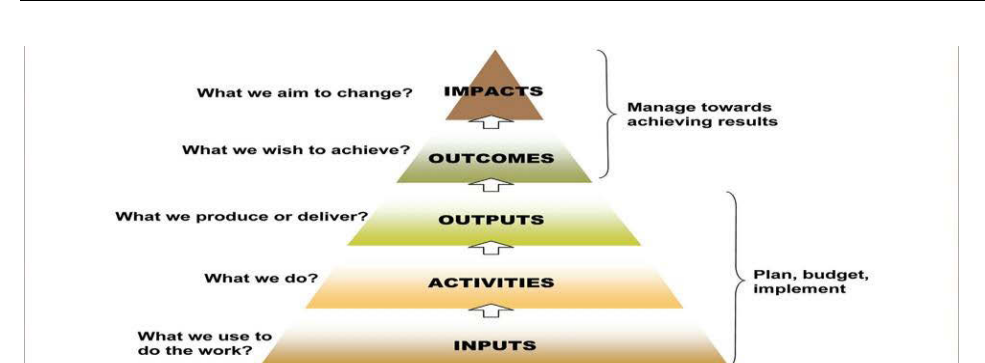
Figure 1. Relationship between the key performance information concepts

The PPI Framework identifies key performance management concepts which seek to organise government and demonstrate how government uses available resources to deliver on its mandate (National Treasury, 2007: 6). These concepts include <sup>13</sup>inputs, <sup>14</sup>activities, <sup>15</sup>outputs, <sup>16</sup>outcomes and <sup>17</sup>impact. In managing for results, budgets are developed in relation to inputs, activities and outputs, while the aim is to achieve the outcomes and impacts (National Treasury, 2007:6). Figure 1 illustrates the relationship between the key performance information concepts.