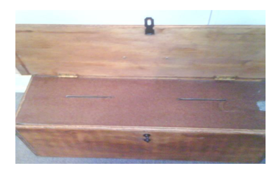
The ICVI apparatus reflecting two "voting slots", with the lid acting as a screen for the participant.