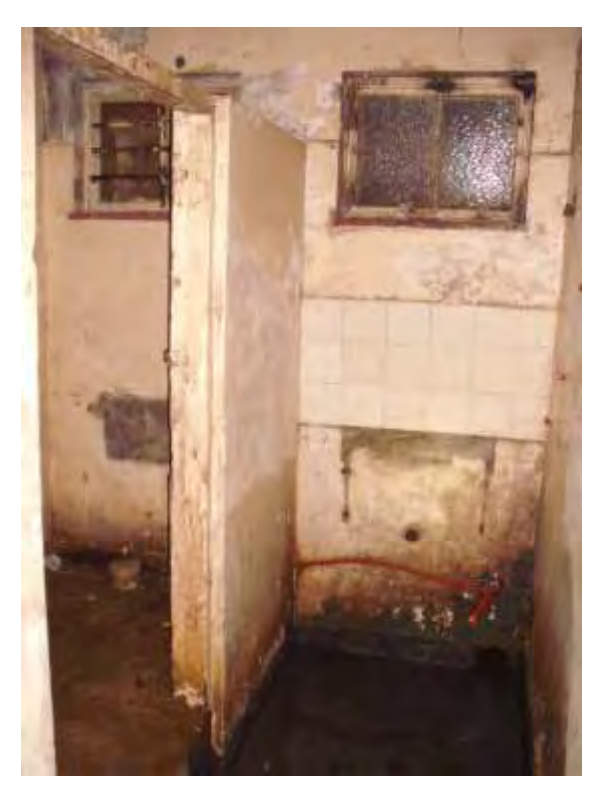
Picture 9 – Shower facilities (with running water) at 55 Alexander Street