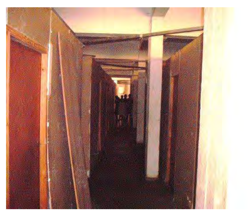
Picture 10 – Rented room units at 55 Alexander Street