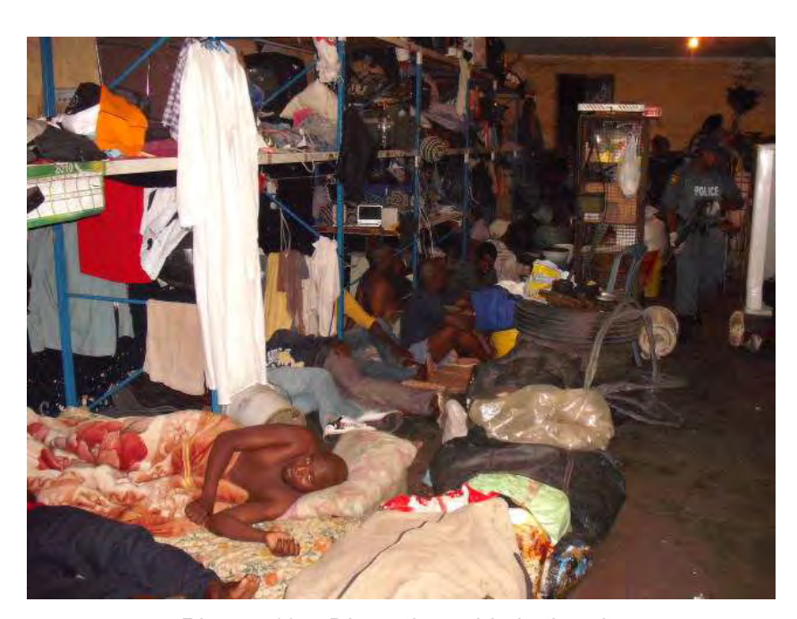
Picture 13 – Disruptive raids in the city