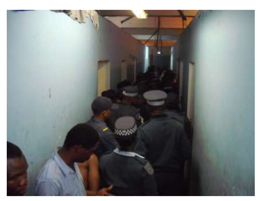
Picture 11 – Disruptive raids in the city