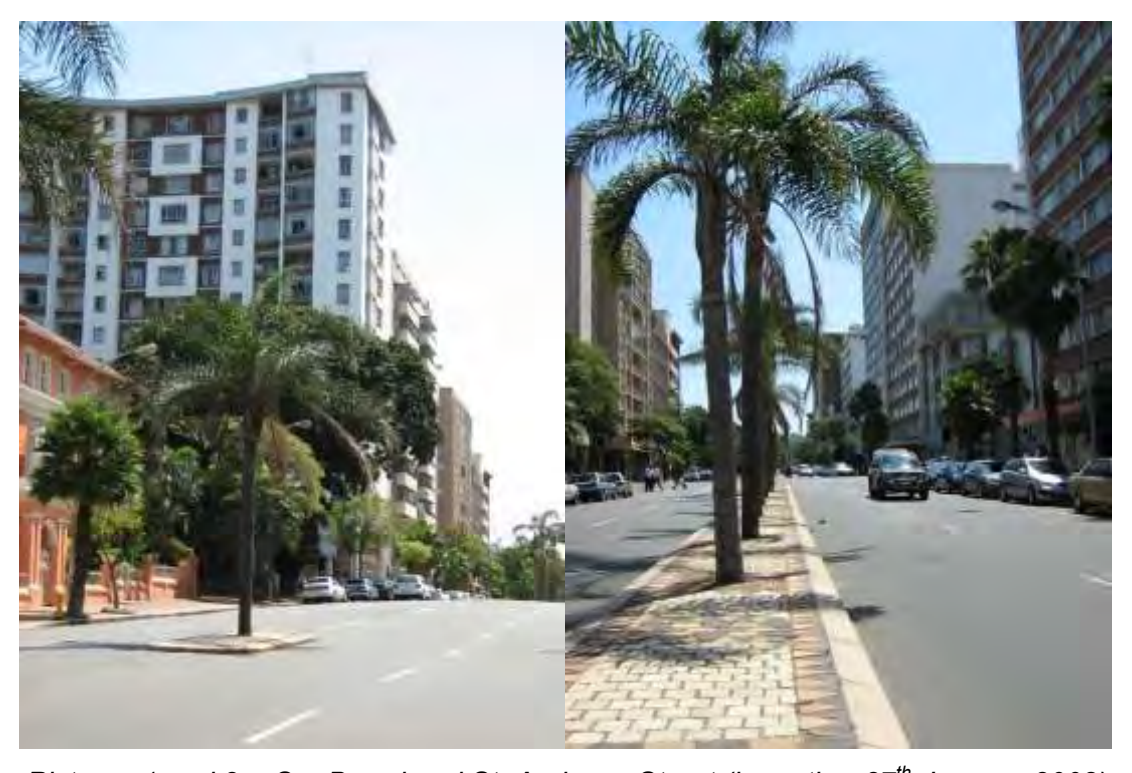
Pictures 1 and 2 – Cnr Broad and St. Andrews Street (by author 27<sup>th</sup> January 2008)

If you stand on a sunny day at the corner of Broad Street and St. Andrews Street and look up towards the park, you would be forgiven for thinking you were looking at a postcard of Miami (see Pictures 1 and 2 ). Outlined against the blue sky tall palm trees line the middle island of the wide street providing perfect symmetry for the 1950s high-rise flats, some of which have beautifully maintained art-deco designs and newly paved sidewalks. There are also a number of well renovated historic buildings such as the Diakonia Centre that houses numerous NGOs, the privately run but city supported Durban Music School, and a small museum that "provides a