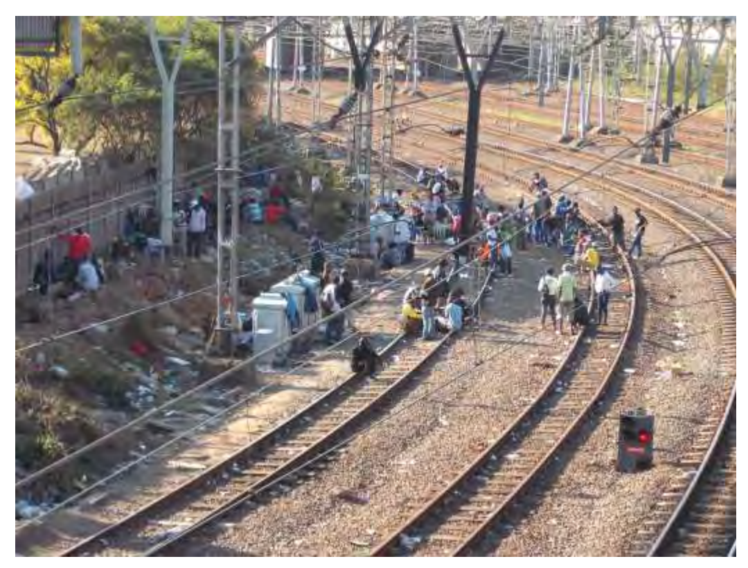
Picture 4 – Rail lines by Alexander Street Taxi Rank

Leaving Ana Capri to turn down Park Lane and cross over McArthur Street and then into St. Georges Street there has been little if any city regeneration or attempts to beautify the road (see Pictures 5, 6 and 7 ). On many days bags of garbage pile up on the sides of the road and the street cleaners seen often in St. Andrews Street seem to have given St. Georges Street a wide detour<sup>25</sup>. Almost all the blocks of flats have pavement shops of various types and on some of the doors and windows rooms for short term rent and daily rates are advertised. Closer to the corner of Russell Street at least three large drinking taverns are open till late in the night.