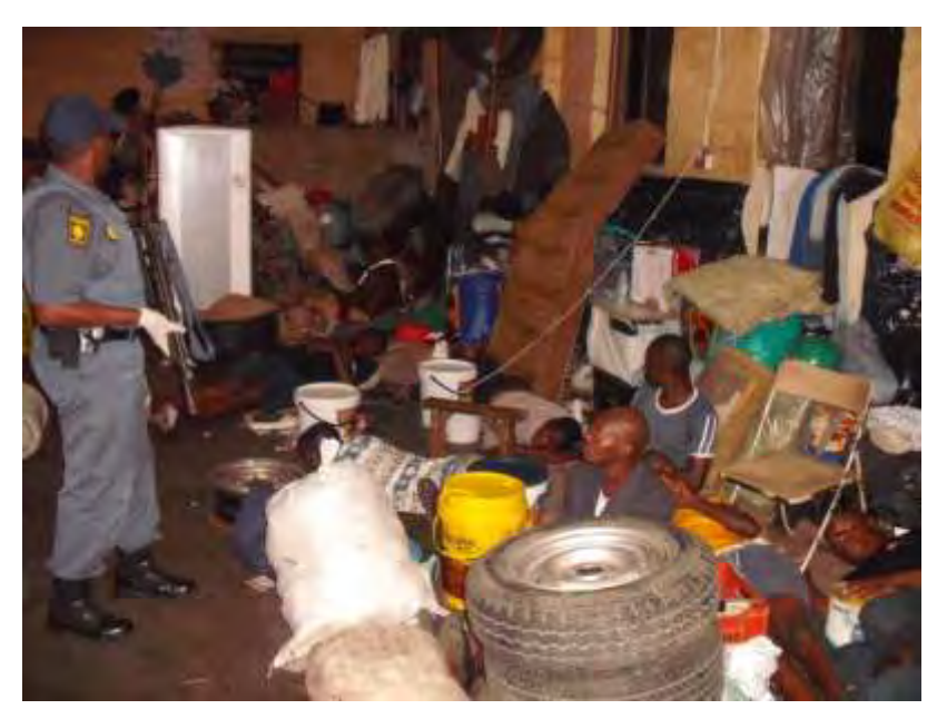
Picture 12 – Disruptive raids in the city