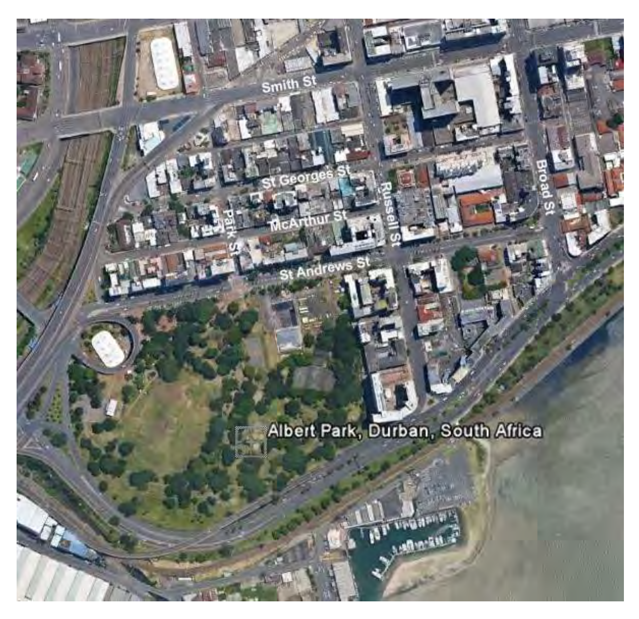
Map 1 : Albert Park Aerial View (Original image from Google Earth 2011 Street names by author)

Note : In 2009 the Durban Municipality changed some of the street names in various areas including the center of the city, however all the participants in this study continued to refer to these streets by their former names. To avoid confusion for the reader in the data extracts I have stuck with the old names. Please see the list below for the street names that have changed in the Albert Park area, and their corresponding new names: