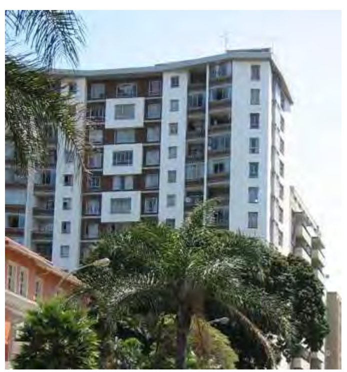
Picture 14 – Spot the offending fabric (by author 27<sup>th</sup> January 2008)

race of the offender. For example, when my partner and I first moved in we did not have a curtain for our bedroom window so used a piece of fabric instead (see Picture 14 ). It served the purpose and we were living on the top floor which made it hard for people to see in. After a month of being in the flat the supervisor approached us to say that there had been a complaint. Apparently the fabric looked scruffy and brought down the aesthetics of the block, we were asked politely but very firmly to get a proper curtain to maintain the block"s standards.