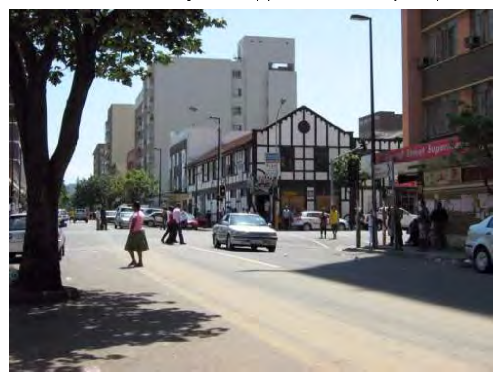
Picture 6 – St. Georges Street (by author 27<sup>th</sup> January 2008)