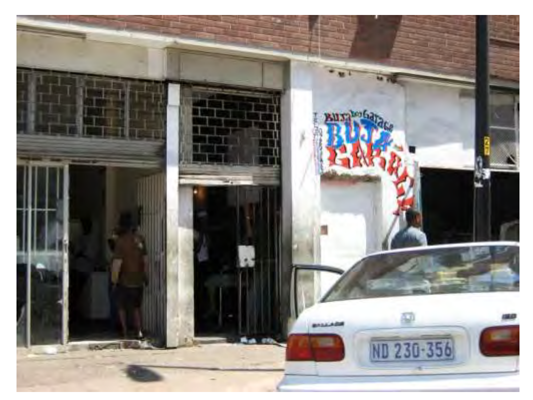
Picture 7 – St. Georges Street (by author 27<sup>th</sup> January 2008)

For many residents living in the Albert Park area there is a spatial and social distinction between what is loosely known as the St. Andrews Street side and the St. Georges Street side of Albert Park. Earmarked for urban regeneration by the municipality Albert Park is many things to many people, a contested space that resists a singular reimagining.