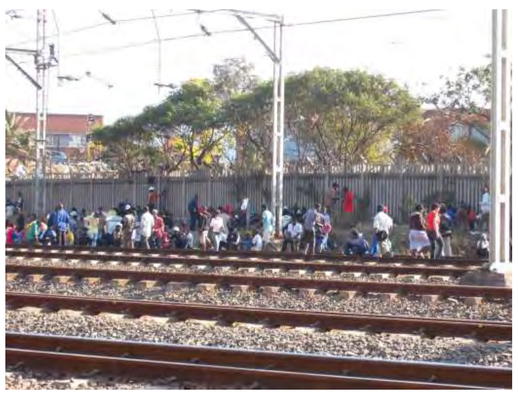
Picture 3 – Rail lines by Alexander Street Taxi Rank

water up to their units in buckets from the standpipe on the ground floor.<sup>24</sup> The block is now under legal administration due to health and safety risks and a large backlog of levies and municipal rates ( The Daily News 5<sup>th</sup> November 2010, and Interview with Legal Administrator 4<sup>th</sup> August 2010).