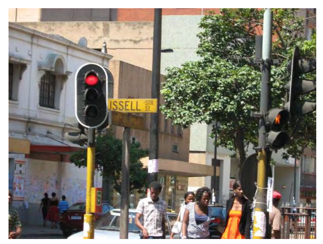
Picture 5 – St. Georges Street (by author 27<sup>th</sup> January 2008)