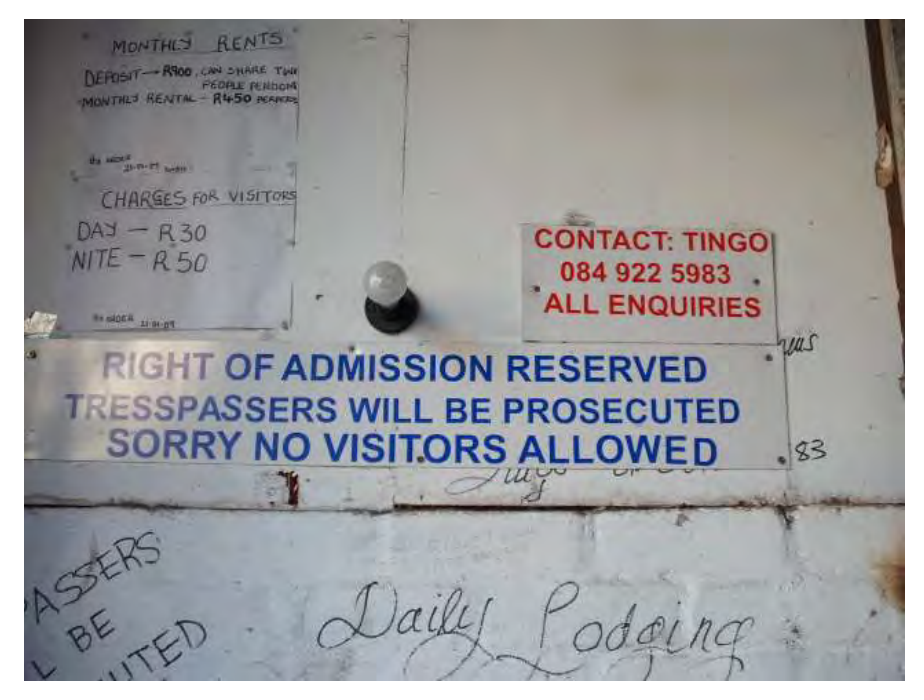
Picture 8 – Daily lodging rates advertised at 55 Alexander Street