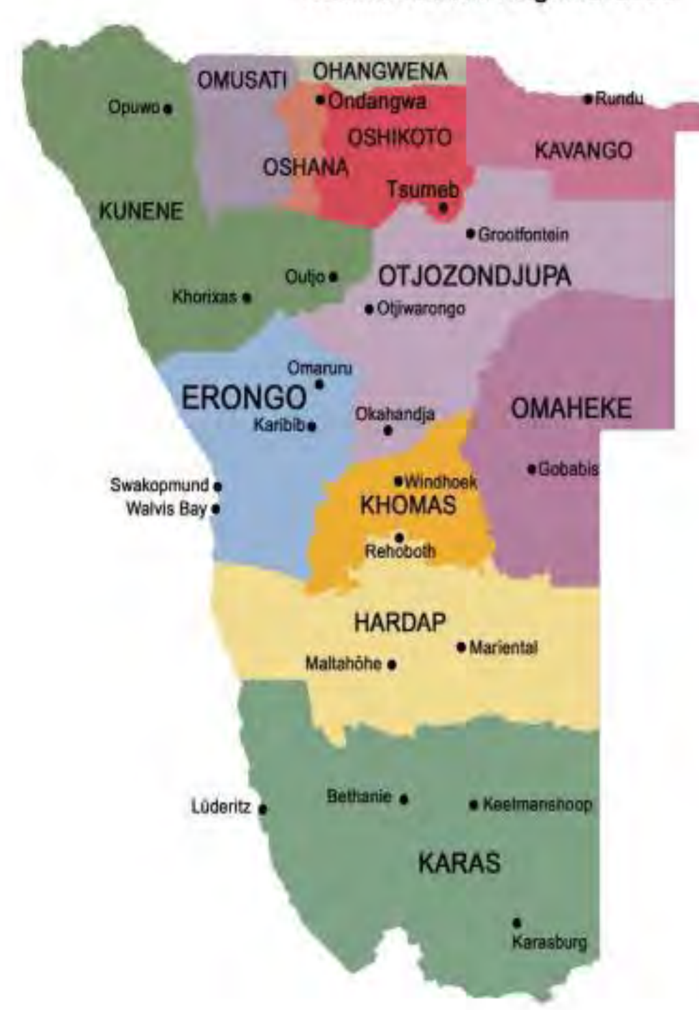
Figure 1: The map of Namibia and its thirteen regions