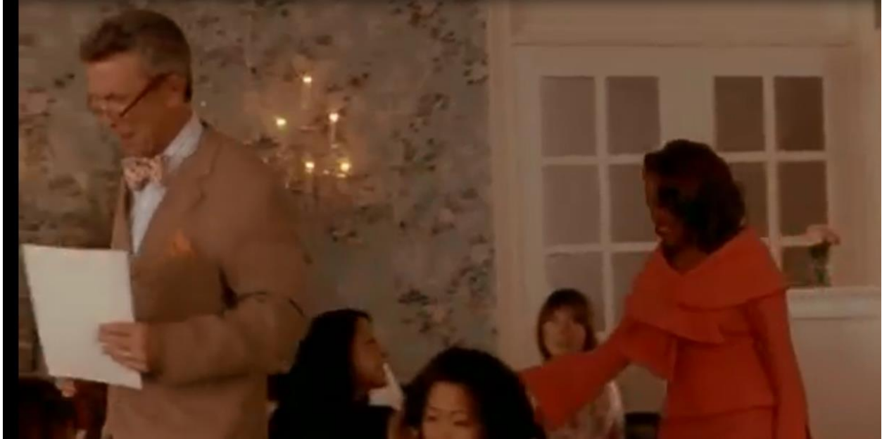
Figure 16. Depicts a glamorous Victoria entering a fancy restaurant where mostly White people dine, Madeas Family Reunion (Perry, 2006).