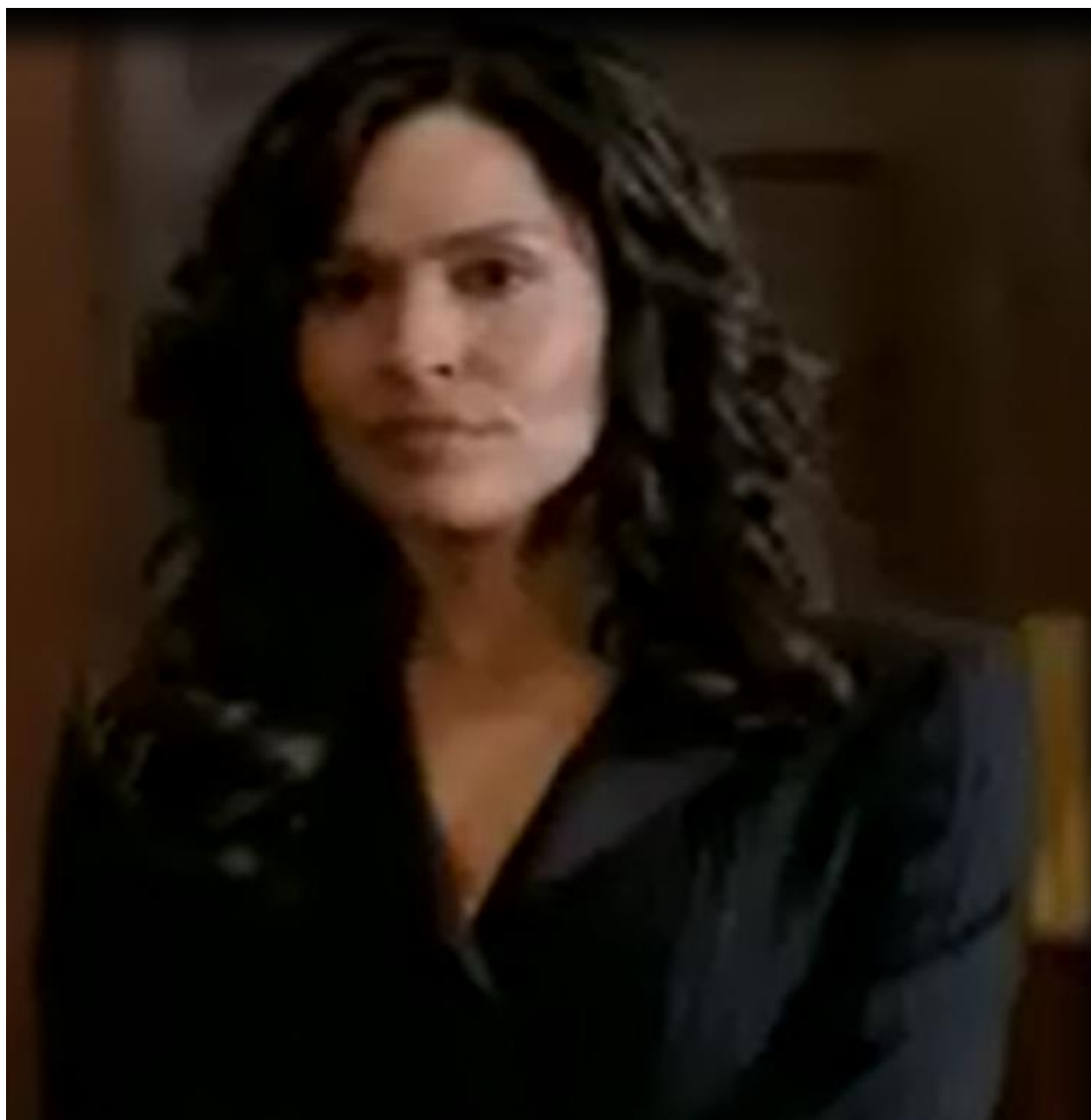
Figure 5. Linda the ‘Tragic Mullata’ in court in Madea Goes to Jail (Perry, 2009).