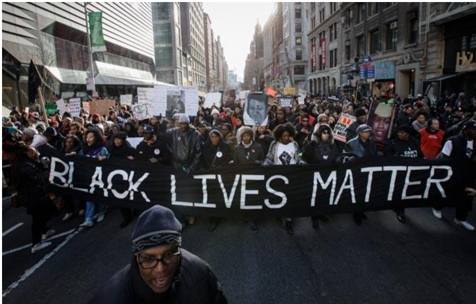
Figure 26: Black lives matter image.

The manner in which the Black community in general is represented forms part of the bigger picture that leads to events such as the #Blacklivesmatter campaign as depicted in figure 28. The many Black lives lost during these recent years are in part the results of the misrepresentation of the Black community by the media. This has resulted in many Black men and women losing their lives and hence the study argues that the media plays an integral part in modeling perceptions and perpetuating stereotypes.