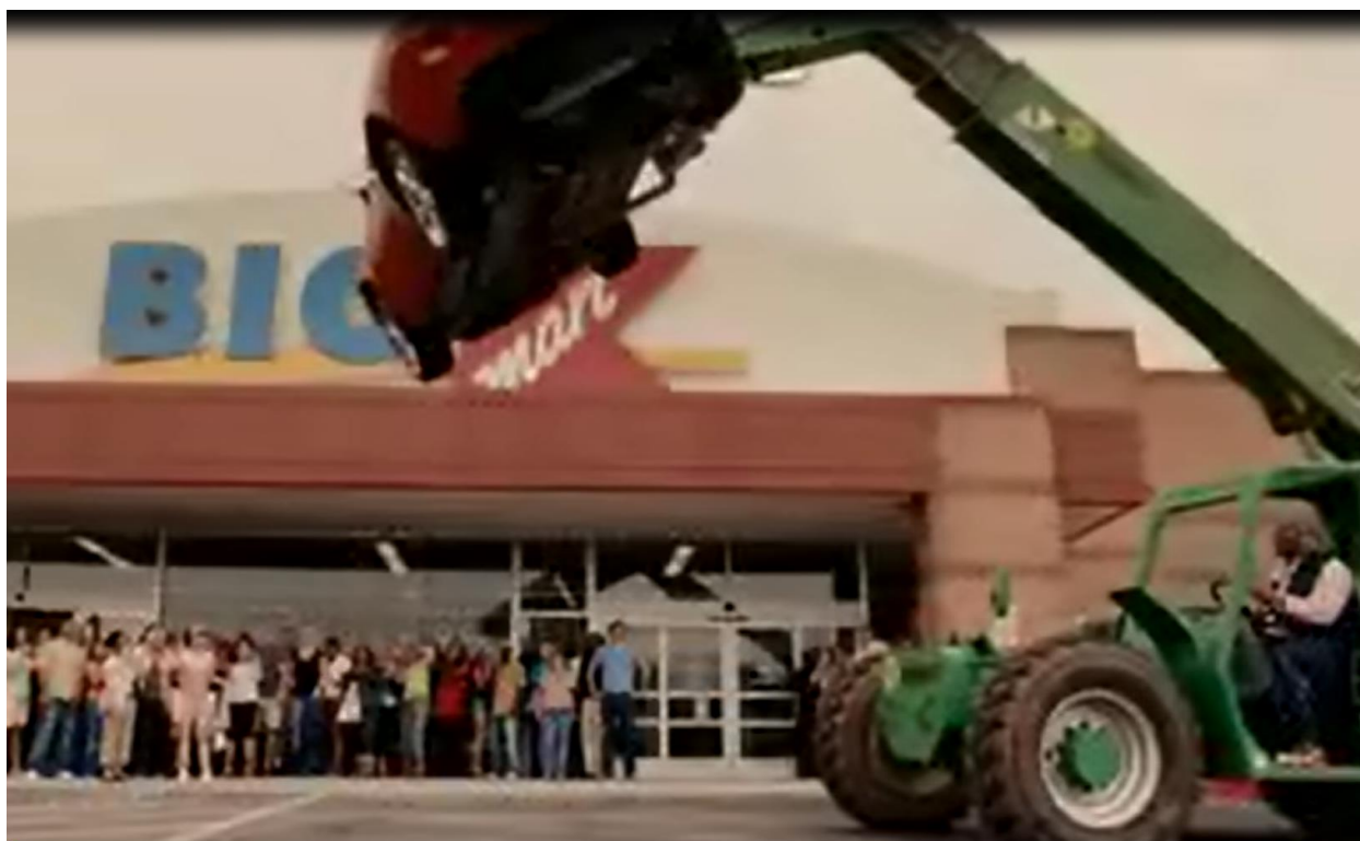
Figure 1. Madea “The Masculine ‘Mammy’” flipping a car at the parking lot in Madea Goes to Jail (Perry, 2009)

The second character was the “ Nurturing ‘Mammy’ ”, because besides the masculine character, she was also seen to possess a nurturing side. She is “motherly” and takes care of a family, like the historical ‘Mammy’. In Fig 2. Madea is seen as a nurturing mother in Madeas Family Reunion when she accommodated a young foster teenage girl at her house, and changed her life for the better. She taught her manners, and respect. She went as far as beating the teenager to discipline her, and encouraged her to focus on school. When the young girl returned home with good grades (marks) Madea said, “That is good, you just proved that you can be anything you want to be” (Perry, 2006). Those were sincere, kind and nurturing words from a mother figure.