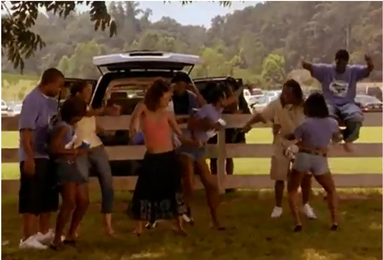
Figure 9. Young Black women dancing in “provocative” clothing in Madea’s Family Reunion (Perry, 2006).

Similarly in Madea's Family Reunion , a group of young women (see Fig. 9) dressed in provocative clothing, and dancing to loud music while “engaging in public displays of affection”, McKoy (2012:142), while the men cheer and dance along with them, denoted and stereotyped the Black family specifically the Black woman as “loose and wild” (McKoy 2012:142).