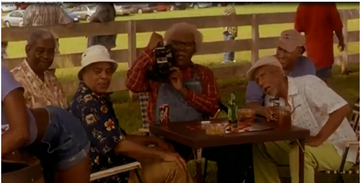
Figure 10. Old men (grandfathers) drooling over a young woman in Madeas Family Reunion (Perry, 2006).

works towards eliminating sexual violence and assisting sexual assault victims, the attitude of sexism makes women of “color more susceptible to sexual violence”. Furthermore, this prejudice makes it difficult for these Black women not only to receive fair treatment within the criminal justice system, but makes it even more difficult for them to receive and access support services. The organisation also confirms that women of color or Black women are, and have always been habitually portrayed as “promiscuous or hypersexual”. These “Jezebel” stereotypes therefore endorse the notion that Black women cannot be raped because “they are willing participants in all sexual activity” (Connecticut, 2017). The depictions on these films regarding Black women are inappropriate, as they portray Black women to be promiscuous, even when matured as depicted in Fig 11.