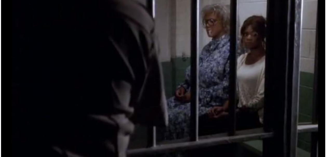
Figure 17. Depicts Madea and her niece Hellen in a jail cell after trespassing and ransacking Hellen's former house, Madea Goes to Jail ( Perry, 2006).