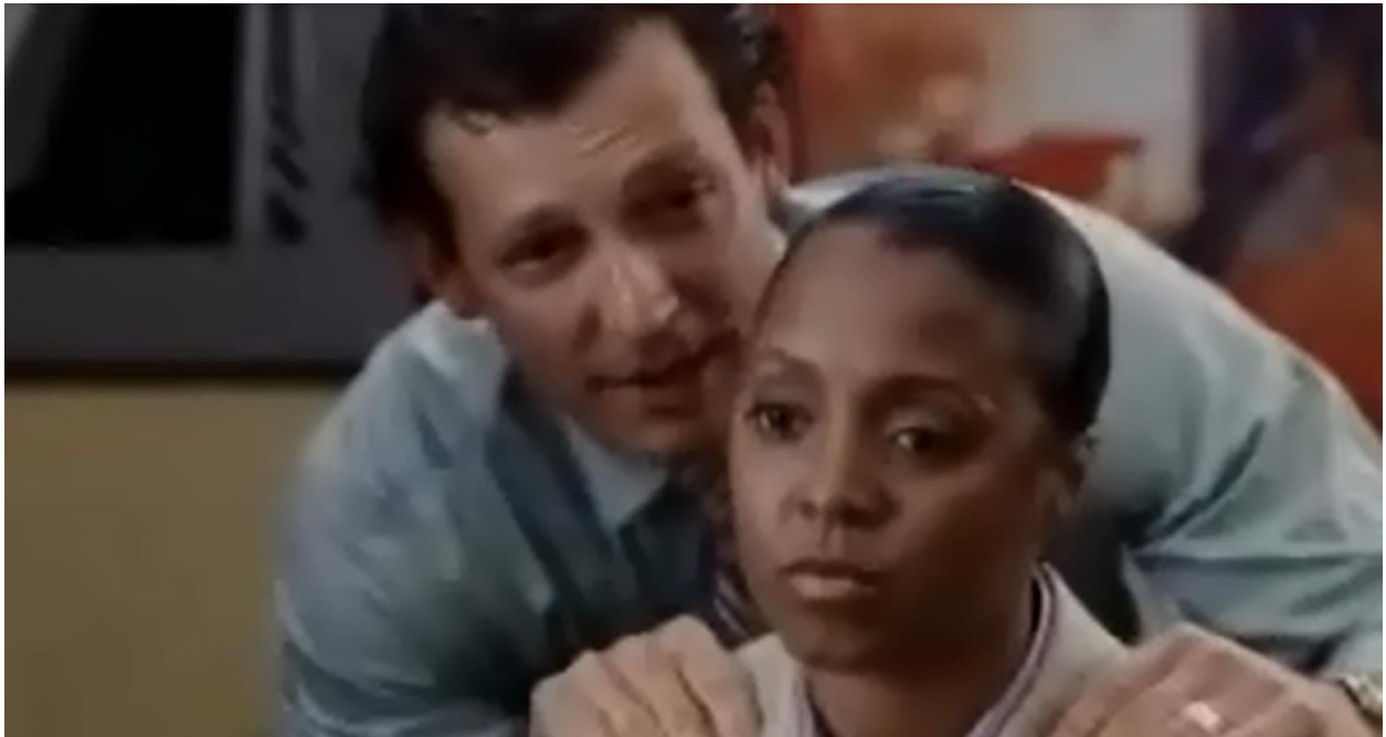
Figure 18. A White employer seeks sexual favors from a Black woman in order for her to gain employment, Madea Goes to Jail (Perry, 2009).

statement above. The scene portrayed a Black woman being taken advantage of, simply because she is supposedly “uninhibited”.