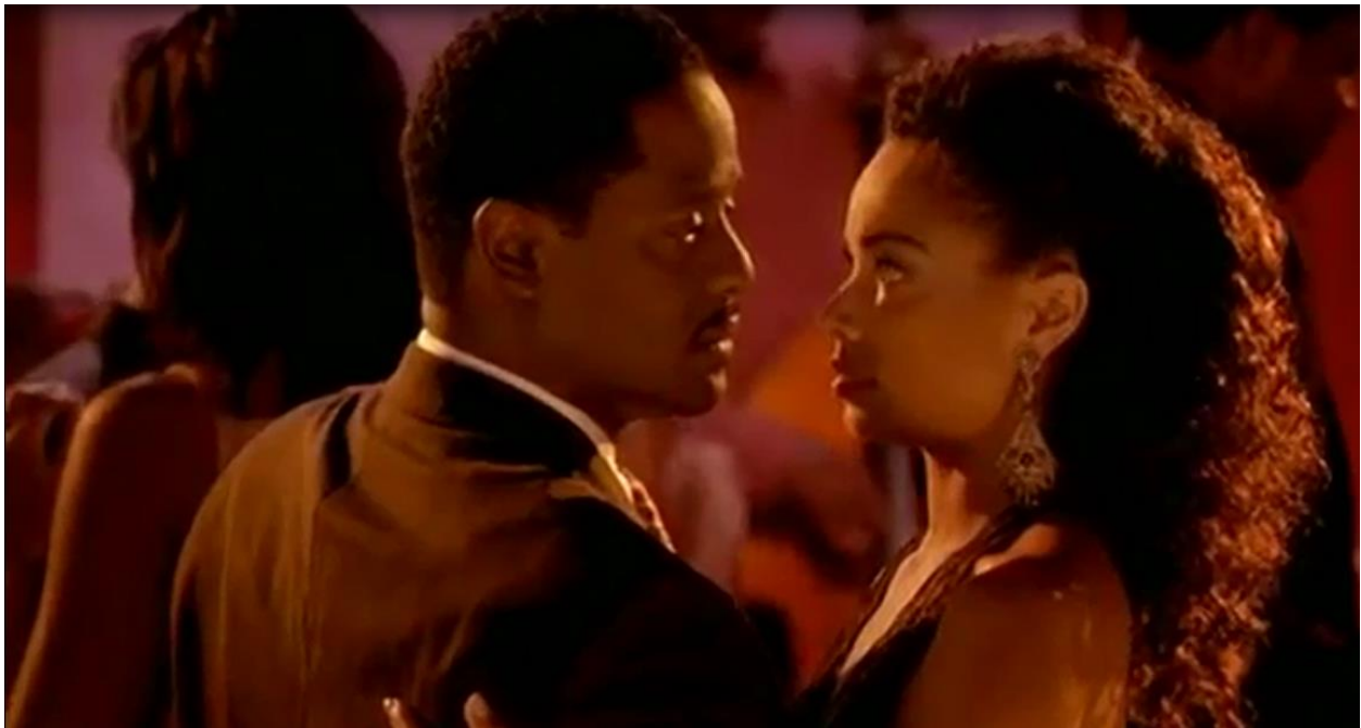
Figure 22. Carlos dances with his fiancé to prove a point that they are happy albeit false. He is threatening her while busy dancing, Madea's Family Reunion (Perry, 2006).

The very same Carlos proved to be a sociopath when he dances with Lisa (see figure 22) to prove to society that they have a happy marriage. He utters these words to her such as “You like to provoke me don’t you, and “I love you to death and I mean it”. The study affirms that there are such men in the world, pretentious, manipulative and psychotic, but this again should not be considered a laughable matter.