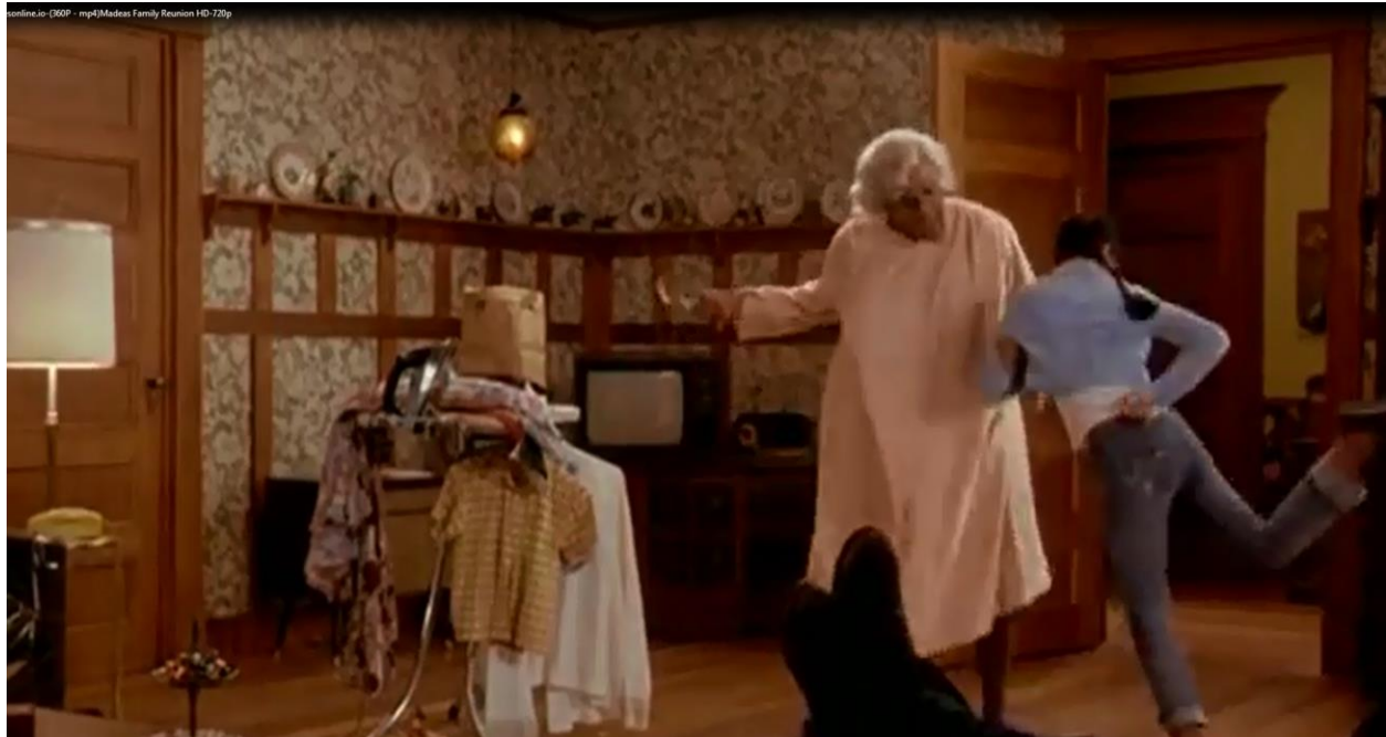
Figure 2. The “Nurturing ‘Mammy’” punishing the adoptive girl and then encouraging her to focus on her education in Madeas Family Reunion (Perry, 2006).

Finally, Madea was seen as a “ Dim-witted Mammy ” showing her disregard for the law, and her inappropriate behaviour. Her vocabulary was perceived to be that of an uneducated person, and she seemed unbothered by that. In Madeas Family reunion , Madea could not say algebra, but said “Algero” when the teenage girl showed off her good marks to her. In the same film ( see Fig 3), Madea was portrayed in a rather precarious position with a saw blade in her hand destroying Charles’ s furniture because she felt that her niece Hellen deserved half of everything in that house. This behaviour then landed her in jail. She would go as far as fighting physically with police, since they did not terrify her. This behaviour then questioned her intelligence.