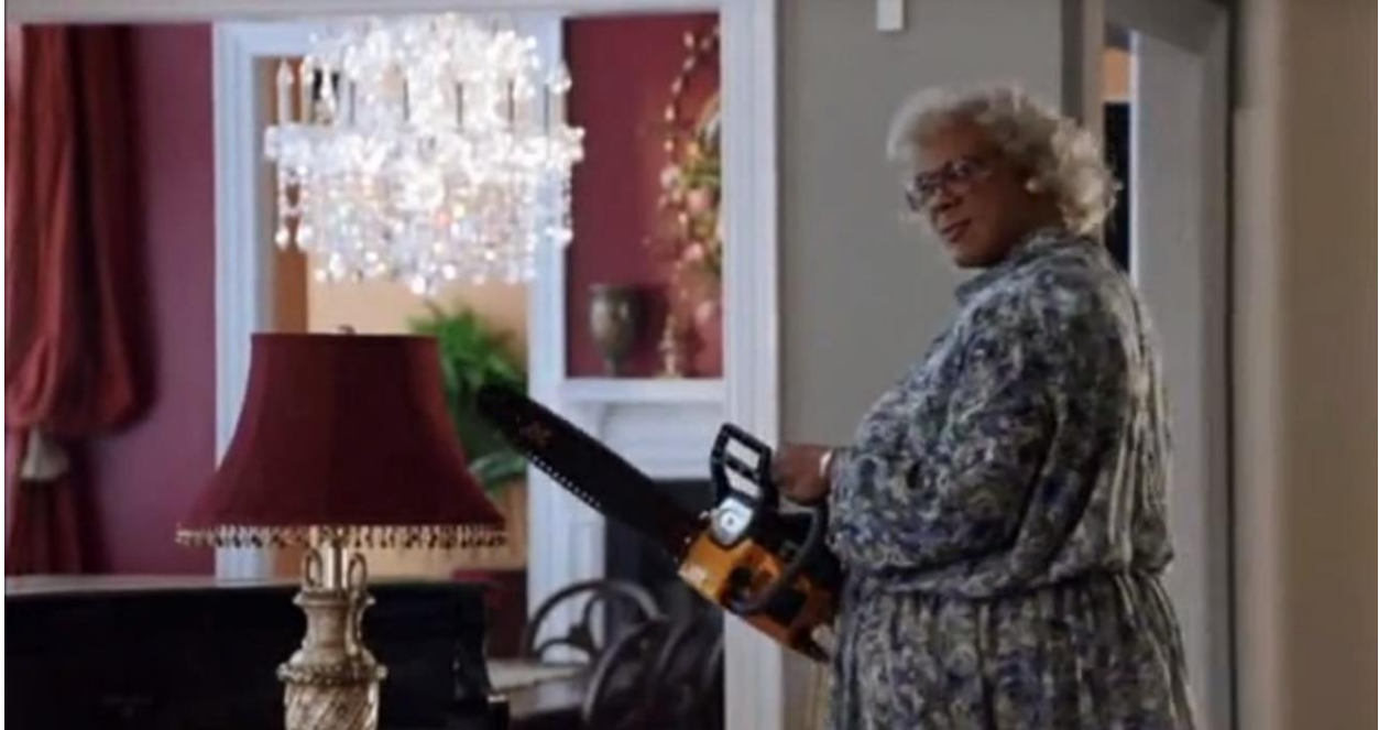
Figure 3. The “Dim-witted Mammy” Madea with a saw blade trying to cut everything in half so that her niece Hellen can walk out of the marriage with her fair share the asserts in Diary of a Mad Black Woman (Perry, 2005).

In these films, Black women like Madea or “Jemima” as the White woman in Madea Goes to Jail referred to her, were portrayed as very dangerous, dominant and almost manly or beast-like. They are objectified as the “Other” not only by White people but also by Black men. Black women as compared to their White counterparts constantly fight this objectification by living two lives, one for “them” (Whites) and one for “ourselves” (Black women), (Collins 1990:94).