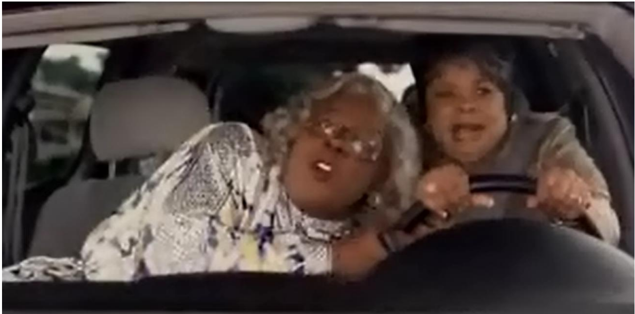
Figure. 12 Depicts Madea trying to hit another car by pushing the accelerator with her bare hands, because this man disrespected her daughter Cora through cutting in front of her, Madea Goes to Jail ( Perry, 2009).

them, often fueled by sexism. This was evident in the three films analysed. In Madea Goes to Jail , Madea is heard saying to Titi, one of the prisoners she shared a cell with, “what do you mean brownie, are you trying to call me Black?” (Perry, 2009). Similarly, in the same film, Madea is seen causing an accident to punish the man who cut in front of her daughter (as seen on Fig. 12).