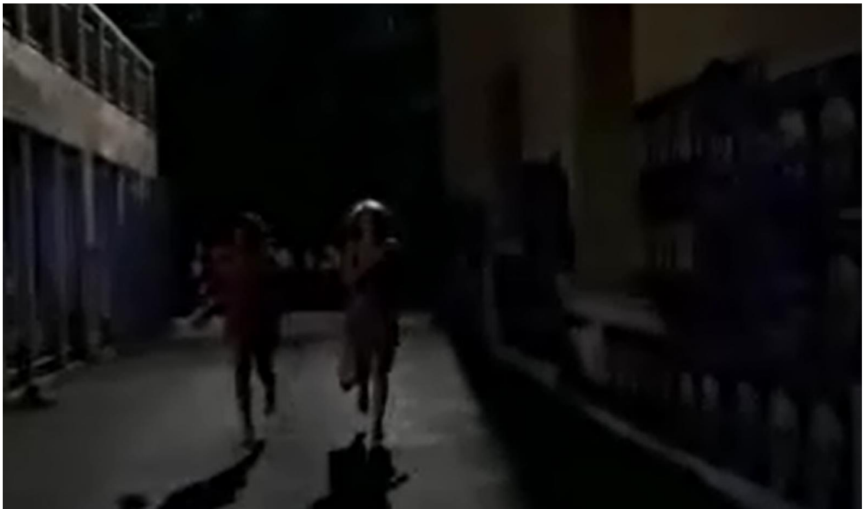
Figure 24. Shows Candace and her friend running away from a pimp, Madea Goes to Jail (Perry, 2009).