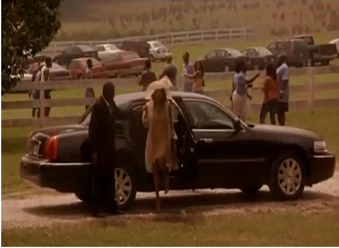
Figure 4. Victoria the “Tragic Mullata” arriving at the family reunion driven by a chauffeur in Madeas Family Reunion (Perry, 2006).

Furthermore, she was arrogant because she lived in the suburbs comfortably, with a chauffeur to drive her around as seen in Fig. 4. Her arrogance and condescending behaviour was also confirmed in the women’s’ conversation during the family reunion, which she hardly attended. When she started talking about the heat in that place, one of the women responded by saying, “It would be cool if you had some regular clothes”. Victoria then responded by saying that her dress was from Paris, which was quite an unwarranted response. It showed the level of condescension which she had for those who were not in her league. The other women start laughing at her, and telling her that in Georgia, people did not dress in that fashion. This illustrated that she was no ‘ordinary’ Black person. She afforded clothes from overseas, and is therefore associated with wealth and perhaps even Whiteness. Madea uttered words such as, “Well this hot Georgia, it’s not Pariiii (Paris), so we don’t wear dresee ( dress) like dat, it looks silly, tryin’ to look bougee, wee wee,