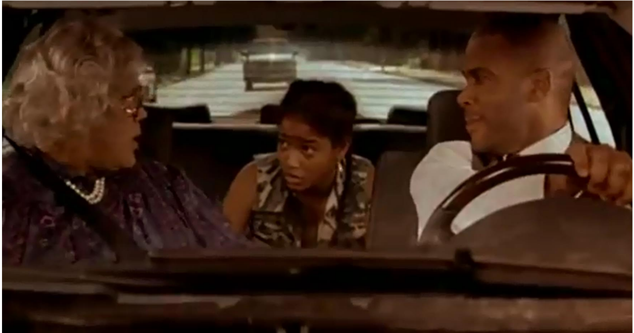
Figure 13. An adopted teenage girl talking back to adults symbolizing disrespect in Madea's Family Reunion (Perry, 2006)

The study argues that representations like these indicate that Black women however young they may be are aggressive and ready for a fight. The study also maintains that Perry's representations of Black women in these films perpetuate stereotypes held by those outside of Black communities..