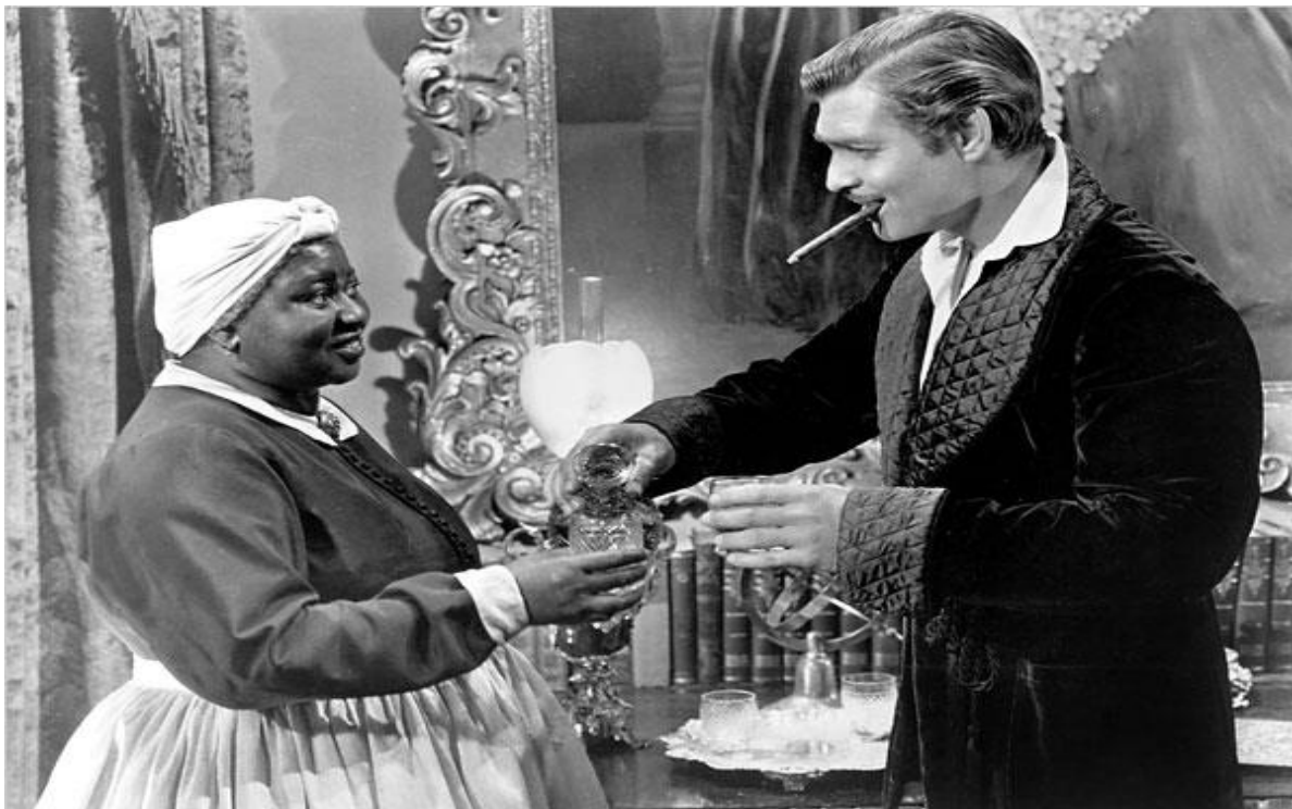
Figure 25: The Mammy

If we take a moment and reflect on what audiences have seen about African-Americans then (during slavery) to now, we can clearly see that little alarmingly has changed. Figure 27 below depicts a picture of an African-American woman in the famous film of 1939, Gone with the Wind . The features of this woman can be compared to that of Madea. She is the Mammy. A matriarch in nature, but a servant to her master. Madea possesses similar traits, the only difference being that Madea is not a servant.