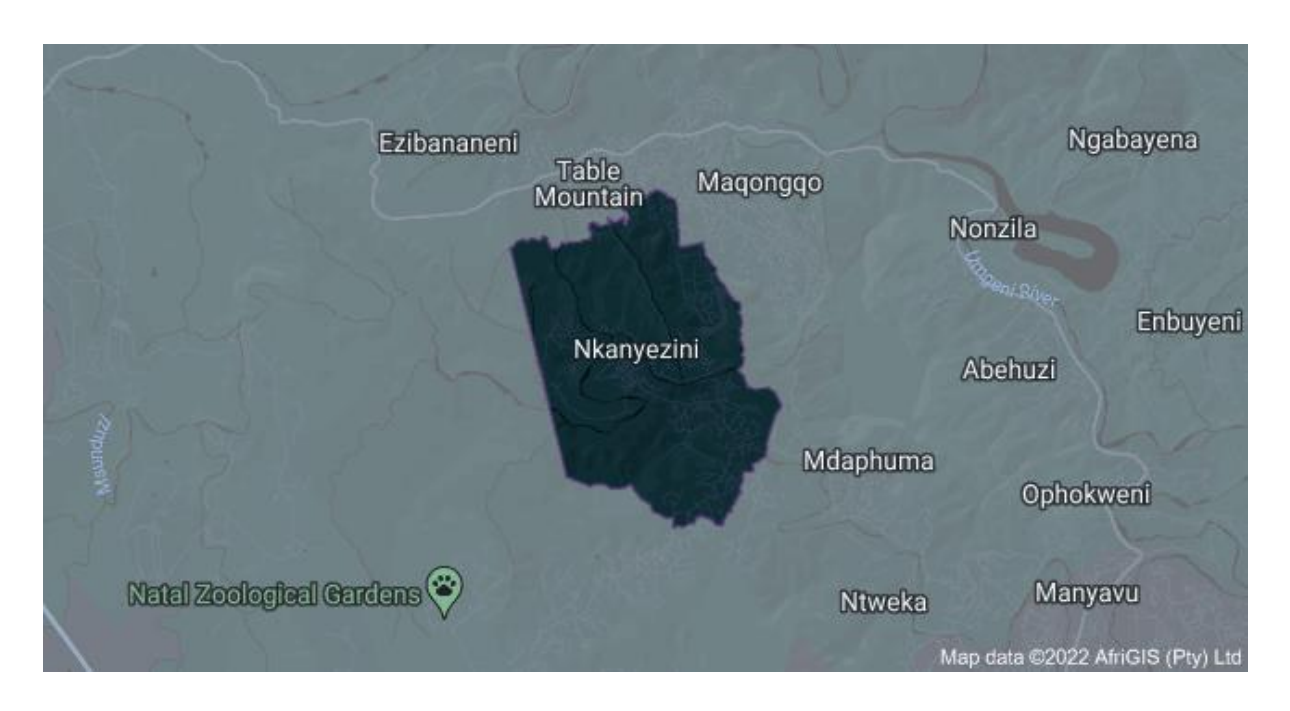
Figure 2: A map of Mkhambathini Area (Available at: https://municipalities.co.za/map/1086/mkhambathini-local-municipality)