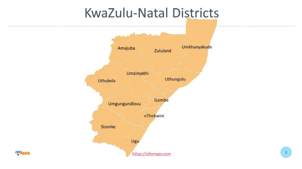
Figure 1: A map of KwaZulu Natal (Available at: https://ofomaps.com)