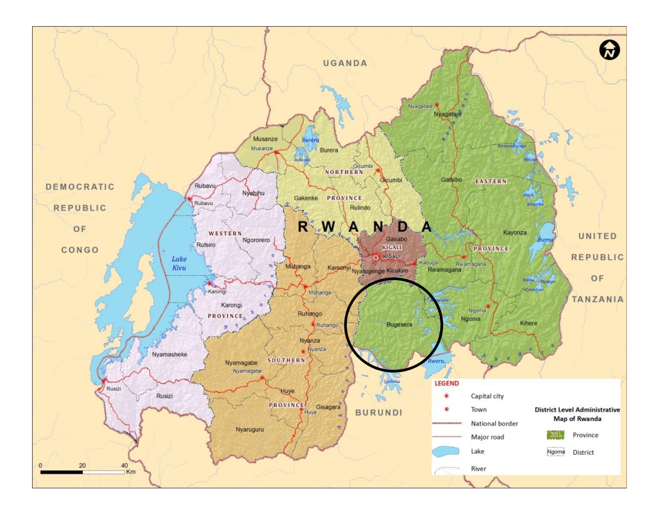
Figure 3.1 Provinces of Rwanda and location of Bugesera District