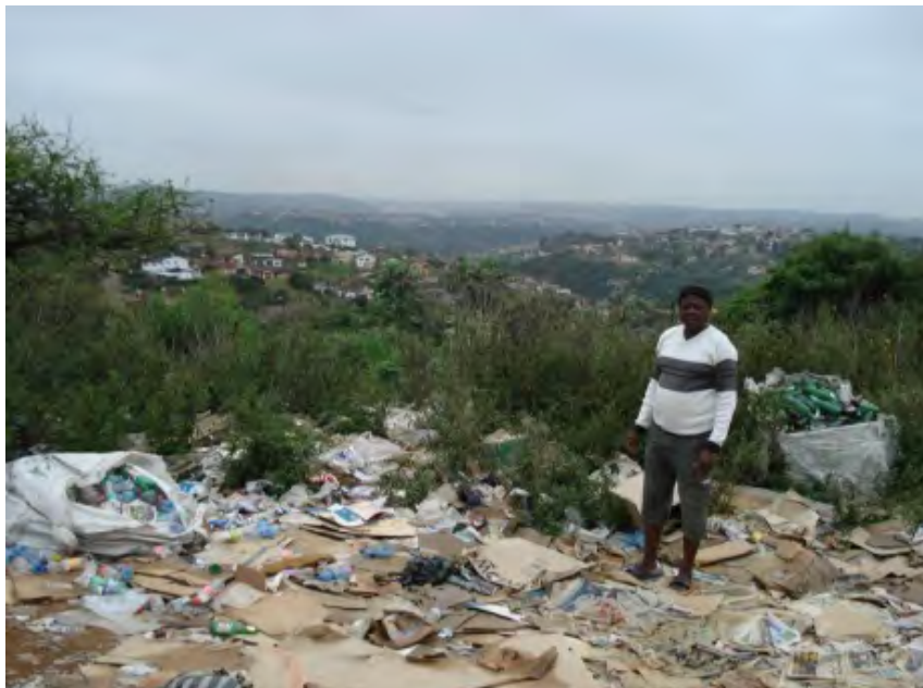
Fig10: Recycling business (Photographed by the researcher).

The picture below (Fig 10) is a good example in support of Bhattacharya (2011: 820–830) as it shows a business that is based in a squatter camps that is not only providing a trash collecting service to suburbs, but is also providing employment for some people. The owner of this business employs four other people to collect trash from surrounding suburbs and institutions and takes it to this site in Banana City where they separate the papers from the bottles and sell them to recycling organizations.