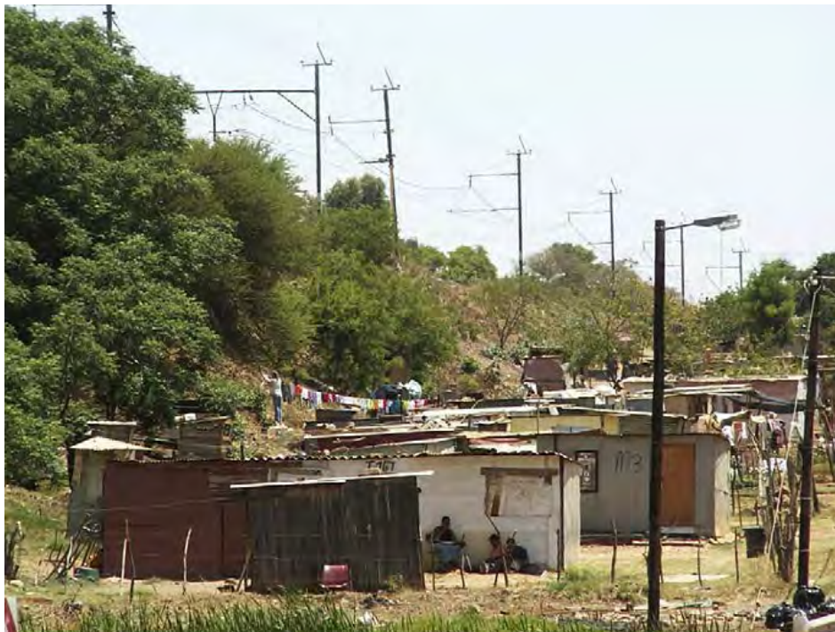
Fig 12: An informal settlement on inappropriate land (Source: Wekesa, Steyn and Otieno, 2011: 238-245).

On the other hand, much of the vacant land is not fit for human settlements, which is why it was vacant in the first place. Such areas are not suitable for economic development ventures. Wekesa, Steyn and Otieno (2011: 238-245) argue that even if squatters do manage to acquire the land on which they settled illegally, in most cases the land was not worth fighting for because of the lack of economic use the previous land owner could derive from it. See the picture below which shows that this piece of land is not a suitable place for people to live as it is close to major power lines and is too small to sustain the community that lives there.