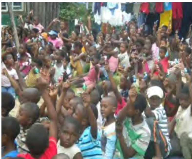
Fig8: Overcrowding at Cato Manor pre-school

Although both the Banana City and Cato Manor informal settlements have schools close by, the residents do not always take advantage of these services. The picture below shows the large number of young children at the local pre-school in Cato Manor, which is a community project that was started with the help of a charity sponsor. The overcrowding and children sitting on the ground highlight the poverty in the area. However, the picture also captures the children’s desire to learn. This indicates the need for further development in the area