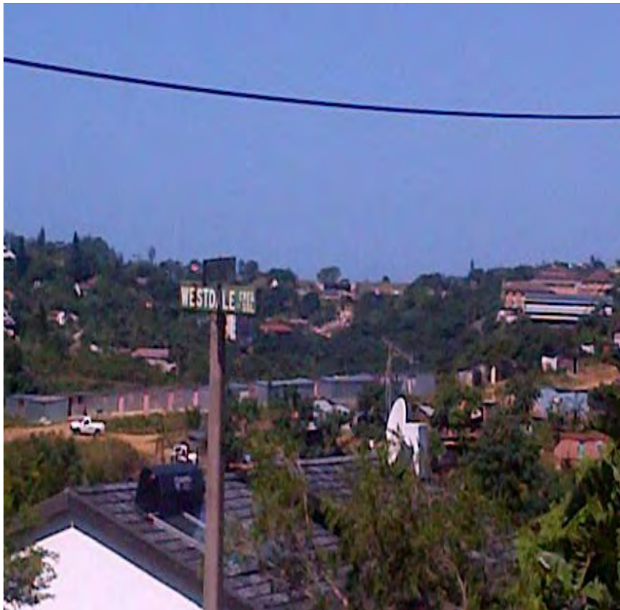
Fig 6: The new area of Banana City.