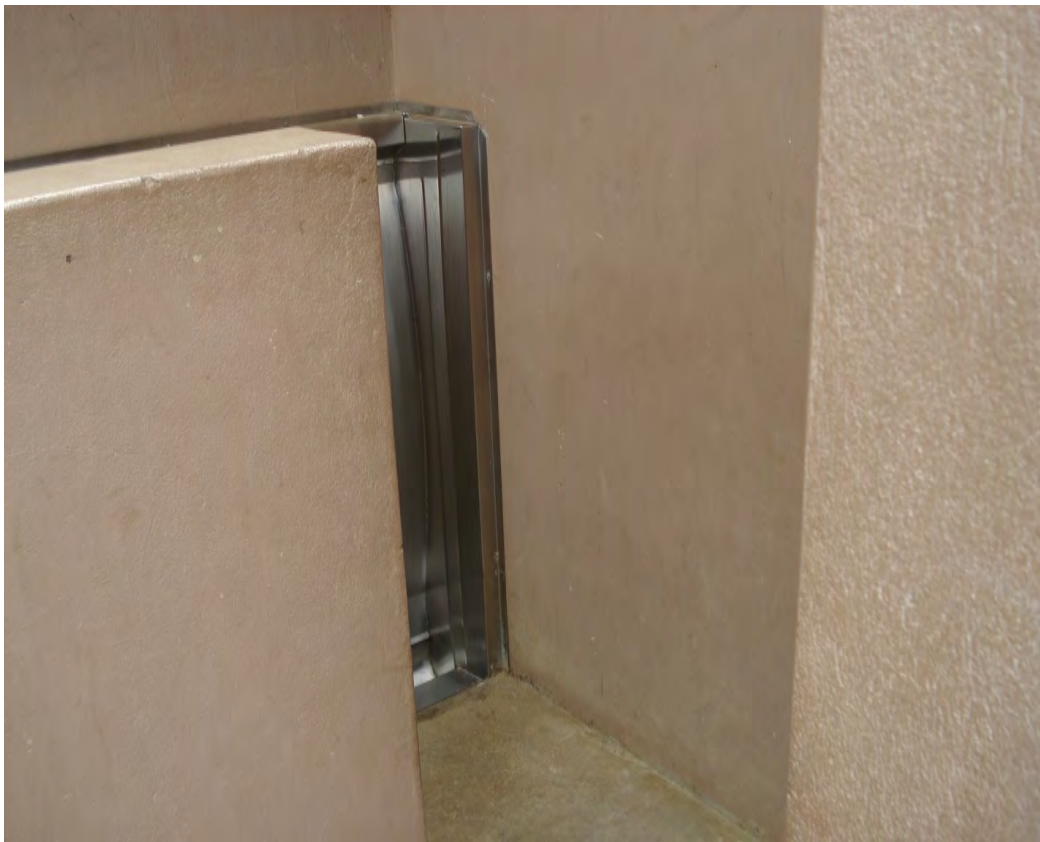
Fig 14: A male urinal at Banana City Squatter Camp (Photograph by the researcher)

Fig 14 below (Part of running water flushing male urinal toilet) shows a project initiated by the EThekweni municipality to build toilets using the skills of local people who have small construction businesses. The picture reveals the talent of local builders as well as those of local cleaners, while also showing the co-operation of the community to keep their only cement and construction built building in their squatter camp clean. The initiative highlights the skills of community members showing that they have the potential to produce work of a high standard. It also displays the active participation in one way or the other of various locals in the economic activity of the region.