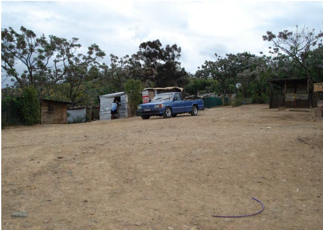
Fig 9: Small informal businesses in Banana City, Westville

The picture below shows some of the small businesses in Banana City, Westville. The picture shows from the left, a bar and spaza shop, which also sells alcohol, as well as a hair cutting business, which is the small shack to the right of the car. The lady with a baby carried on her back is buying goods from a business owner at the spaza shop.