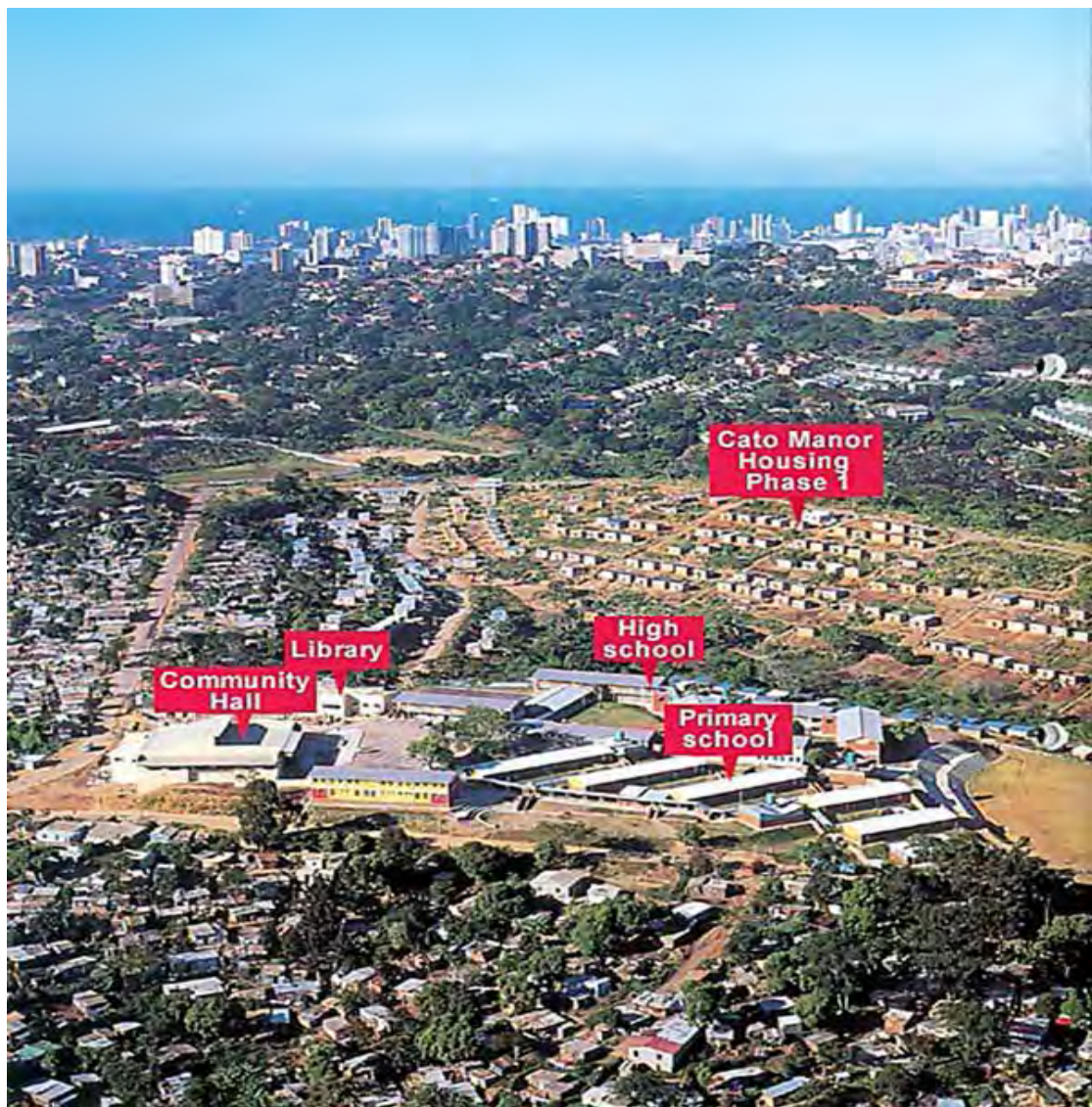
Fig3: The Cato Manor project and its surrounding areas

Cato Manor is situated 7 kilometers from the Durban city Centre. This informal development benefitted from a government initiative that ran from 1990 to 2003. The Cato Manor Development Project (CMDP) was one of the Special Integrated Presidential Projects which aimed at uplifting the community by providing affordable housing and other facilities and services that offered economic opportunities and development. From the picture below one can see part of the housing project that is taking place in the area and several of the services that have been implemented, such as schools, a library and a community hall. Although this area has electricity and running water, residents still make use of illegal electricity connections.