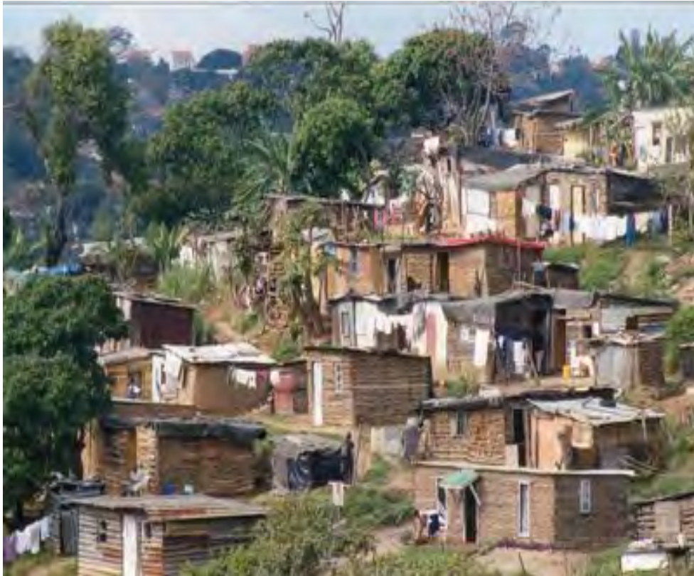
Fig 4: The Cato Manor squatter camp site (Source:

While the Cato Manor settlement has been the subject of vast improvements, some of the community members are still living in the original dwellings which are constructed of planks, corrugated iron, mud, plastic and any other material that can be used as a makeshift wall or roof to protect them from the cold and heat.