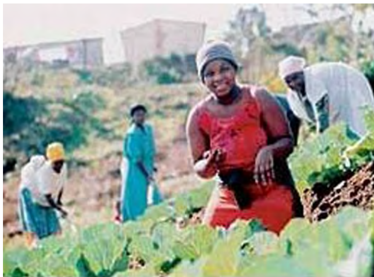
Fig 11: A vegetable gardening initiative in Cato Manor

Land that is part of somebody’s farm, a game reserve or other viable land that is not being used and monitored at the time of occupation (as in the Banana City informal settlement) could be used by entrepreneurs or by the settlers to cultivate crops.