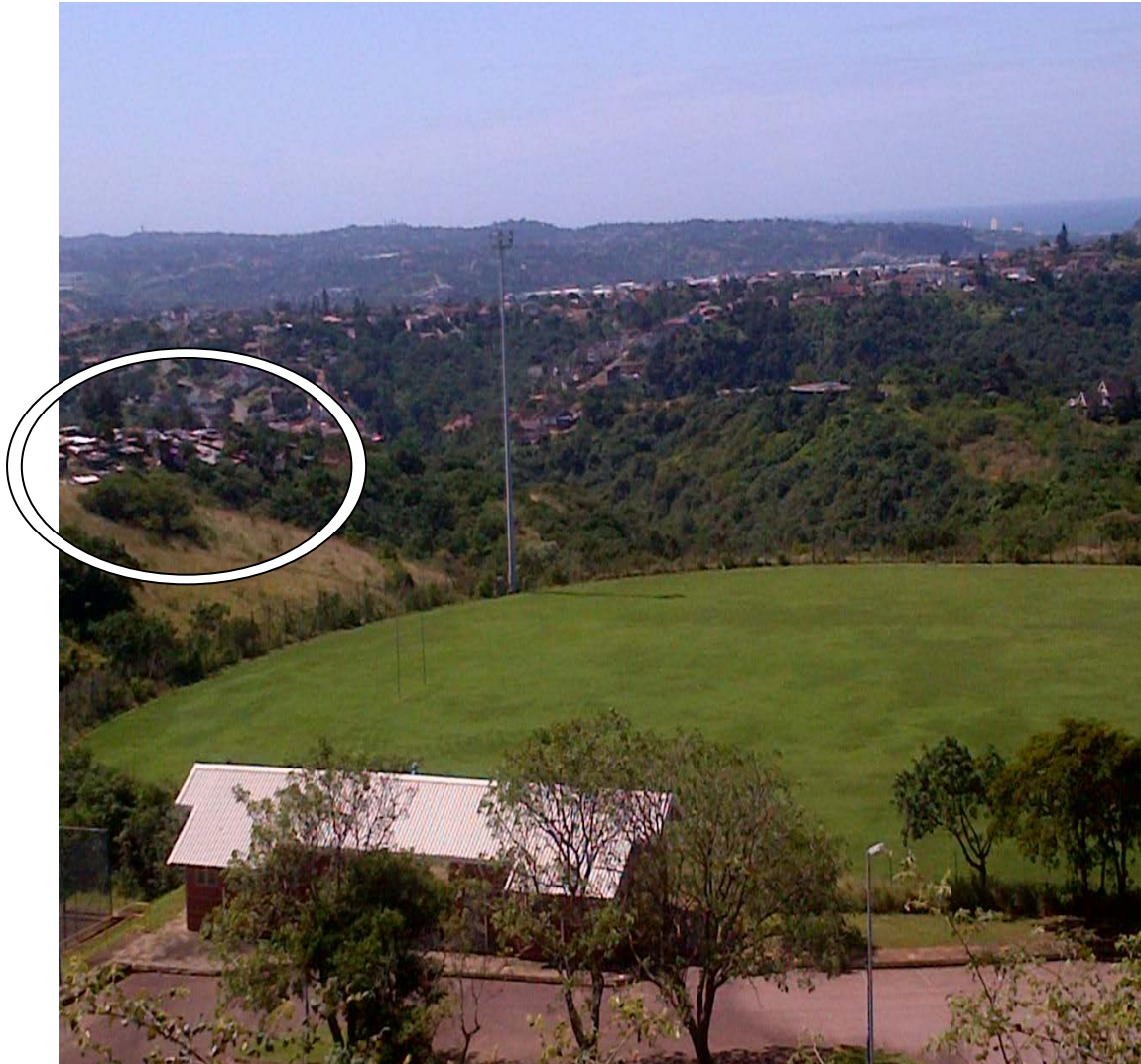
Fig 5: Location of Banana City informal settlement.

right is the view of the Indian Ocean. It is a stone's throw from the female residence of the university and extends to Madrass road at Reservoir Hills, Westville.