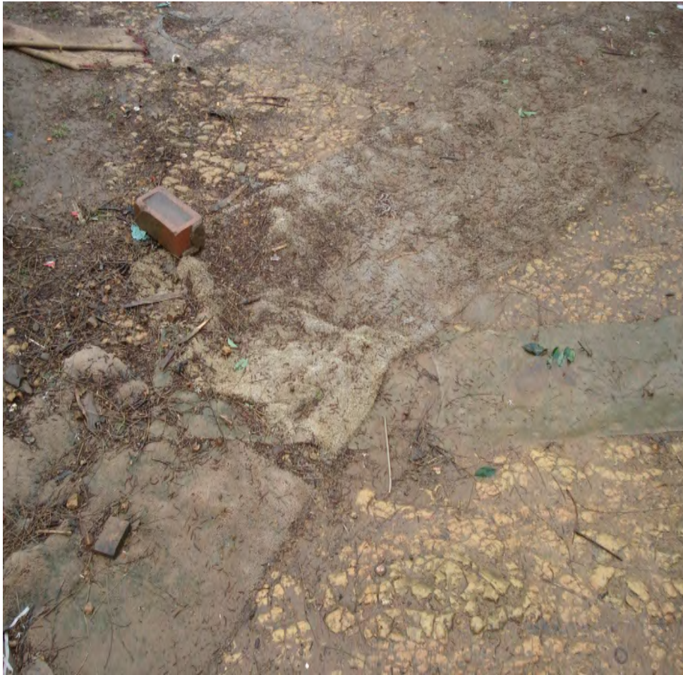
Fig 15: Illegal electricity connections at Banana City Squatter camp (Photograph by the researcher).

The picture above shows how the locals place a cloth or old mat on top of live illegal electricity wires to avoid having to continually dig to access the wires underground as they frequently become burnt out by the high load of illegally connected electricity.