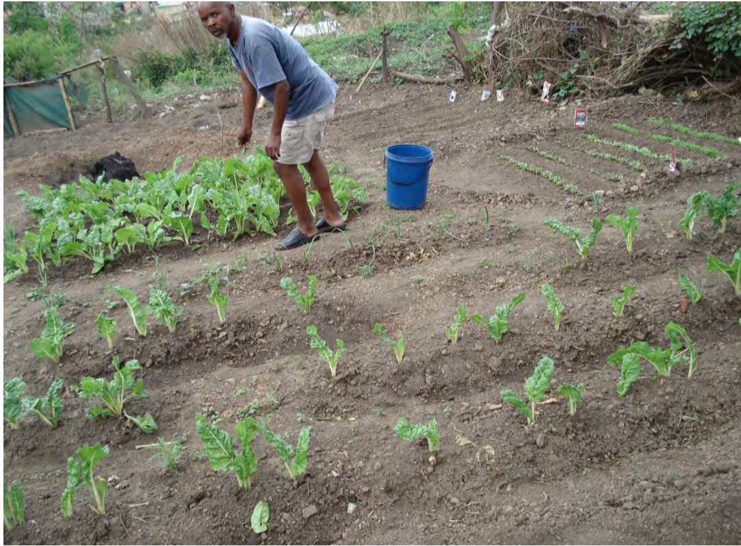
Fig 13: A gardening initiative

started by individual community members, while others have been started by government departments that created opportunities for small business in the area.