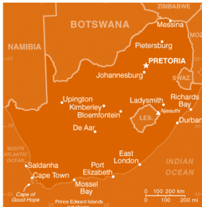
Fig 1: Map of South Africa .

The map below shows the position of Durban (EThekweni) in Southern Africa.