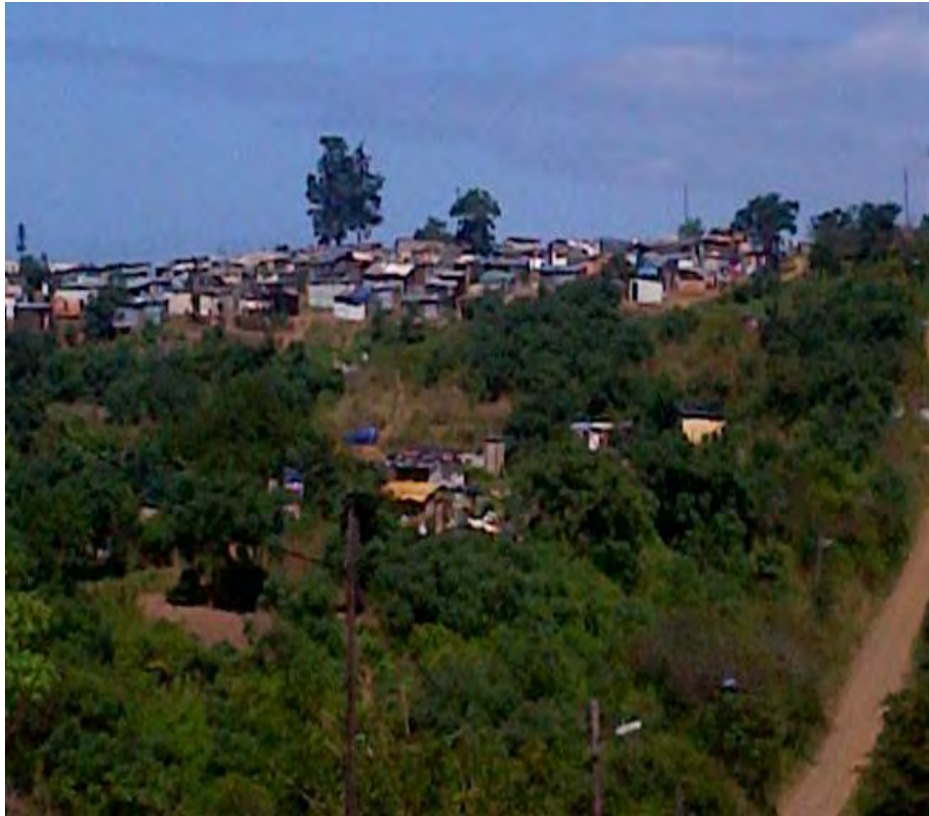
Fig 7: Another view of Banana City

This picture shows the main gravel road that cars and people use to access the village. One can see the poles of street lights along the gravel road going to the village. These street lights are no longer working because the project was suspended due to vandalism and illegal electricity connections. The lush vegetation shows that the land is fertile.